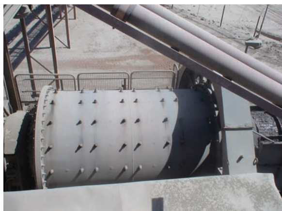
Figure 4. Photograph shows the ball mill.

Real photographs of the open pit, the jaw crusher, and the ball mill are shown in Fig. 2, 3 and 4 respectively.